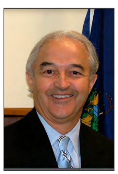
Bill Sorrell for Attorney General, Democratic Party

I would appreciate your support and promise to support Vermonters with special needs and abilities.